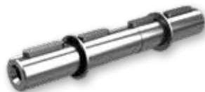
Double output shaft